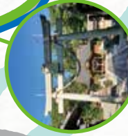
2 Kitada Tenmangu Shrine