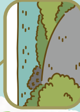
Descent towards ocean