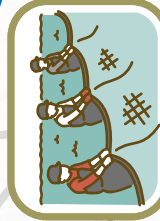
Kidogawa Salmon Traps